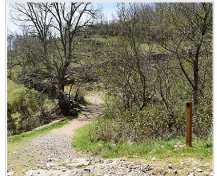
RUTA R07 R07F - SIGN Signpost. Power station 1015 metres