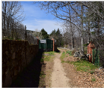
RUTA R07 R07B - PATH Path past private country houses. Orchards 155 metres