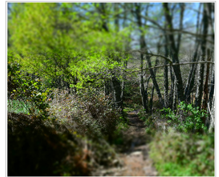
RUTA R07 R07C - WOODS Birch and oak woods 250 metres