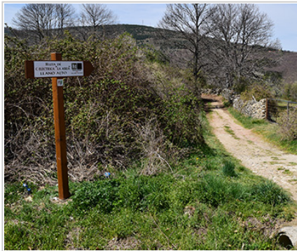
RUTA R07 R07A - START Start post 0 metres