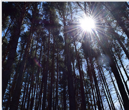
RUTA R07 R07D - PINE FOREST Scots pine forest 495 metres